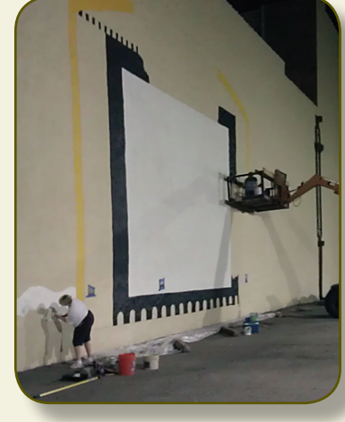
Sue Robinson on the lift as Pat Jones creates the film ribbon.

impressed Sue the most about re-painting the screen was the amount of interest it stirred up in passersby. Several evenings were spent painting into the dark of the night. Still, people stopped, asked about tours, signed up to be contacted as future volunteers, and even picked up a brush and started painting.